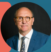
Prof. Em. Dr. Johan Vande Lanotte Ghent University, Belgium